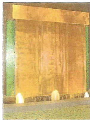
Center of attention: (clockwise, L-R) A rain curtain, negative-edge floor pool and copper water wall with Sicis glass are among a dozen features on display at Aquatec Fountains' new Phoenix gallery.